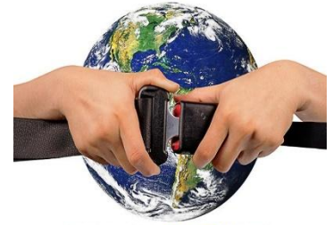
NATIONAL SAFETY DAY

It aims to reduce accidents and promote a culture of safety.